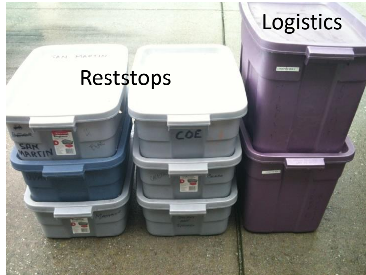
Site Supply Boxes - Trash bags, tools, sharpies, tape, sunscreen, etc