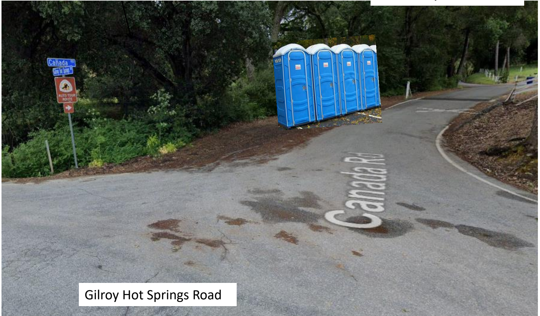
Gilroy Hot Springs Road